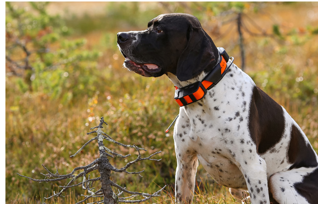
Hunters use GPS collars to identify and track their dogs' locations.

Today's Hunter, Kalkomey Enterprises, Inc.; 2016©