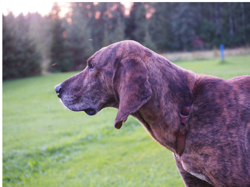
The Plott Hound is the official State Dog, originating in the Balsam Mountain area of North Carolina.

In 1989, the North Carolina General Assembly designated the Plott Hound as the official State Dog. Originally developed from boar hounds of Germany, the Plott Hound originated in the Balsam Mountain area of the state. The hound was used for protection and helped to round up free grazing livestock but, more importantly, was used to hunt bear. Bear hunting provided meat for the table and a source of grease for various uses to early settlers in the remote mountains where self-sufficiency was required.